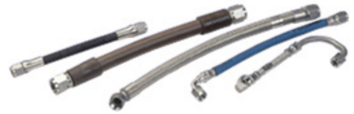
Eaton Aerospace Hose Assemblies