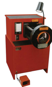
ET9200-10-220 Hydraulic Hose Saw